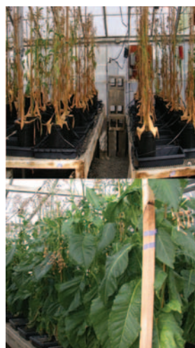
HANGING ON Regular tobacco plants (top) failed to recover after 15 days without water, but plants genetically engineered with an anti-senescence gene (bottom) perked up after watering resumed.

Richards applauds the new strategy, because drought is enormously variable. "It requires multiple solutions to minimize its effect," he says. —S. MILIUS